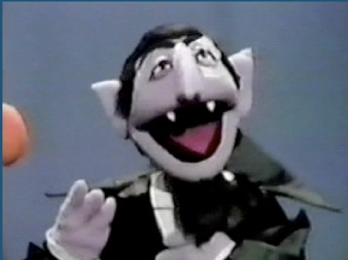
Count von Count