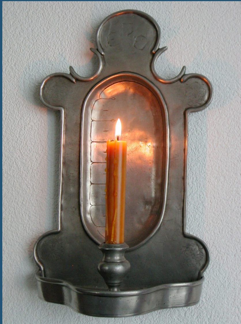
A candle clock